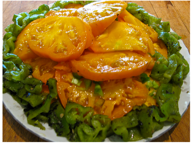
If the government says this is what you need to eat, it gets nothing.