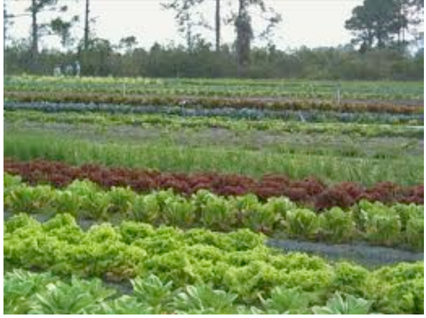
Different crops in the same field and no bare soil: no subsidy.