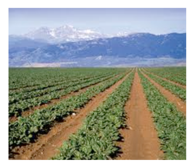
If you see just one crop, and rows of uncovered soil, ready to runoff with the next rain, the US Farm Bill supports it.

Sustainable or Non Subsidized Agriculture