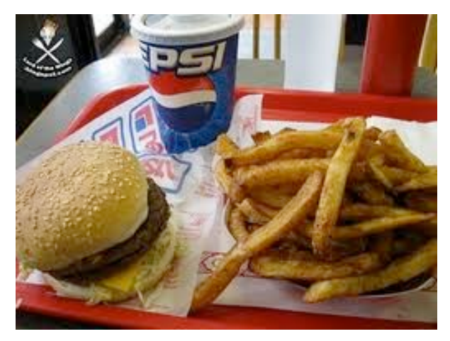
If the government says not to eat it, it gets a huge subsidy.