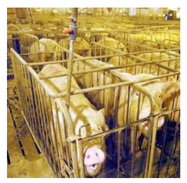
If it provides good jobs for millions of farmers and rural areas, no subsidy.

IF it drives families off the land, to be unemployed in the cities, it is subsidized. Government wants huge farms with huge equipment.