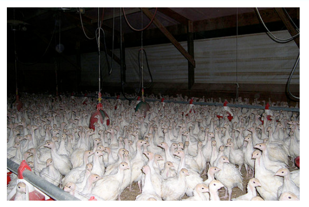
causes Global Warming both from the tractors opening up the ground, and waste from confined animals.

Industrial or Government Subsidized Agriculture